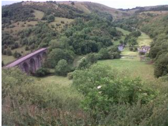
View from Hobbs café - Monsal Head

We left the pass and swung northward and eastward over to Monsal Head through spectacular scenery. Rain was easing as we reached Monsal Head and we enjoyed a coffee at Hobbs café a lovely little café overlooking the valley. We all decided over coffee to return to Peterborough services to fuel up before finally leaving the ride for home.