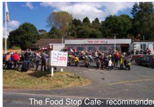
The Food Stop Cafe- recommended

Our Brunch stop at around 12.30 was at the "Food Stop Café" near Bridgnorth about 12 miles from Ironbridge. I would recommend this café to any of you who pass nearby for good food, good service and great value.